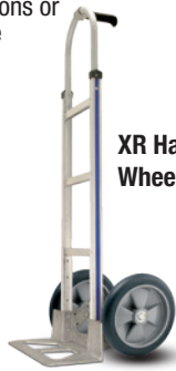
XR Hand Truck Wheels