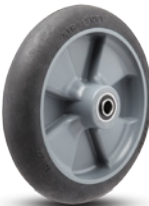
10" diameter model

* Precision sealed bearings and top hats.