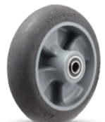
8" diameter model

* Precision sealed bearings and top hats.