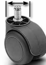
Pivot boss diameter