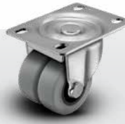
00 Series Page 14