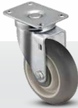
Institutional Page 10-12