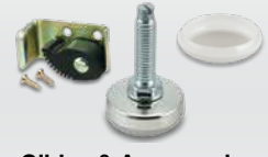
Glides & Accessories Page 58