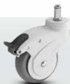
Optimus Page 20