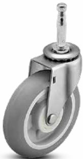
Regent Page 6-8