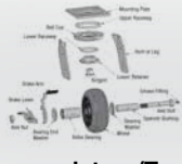
Nomenclature/Terms Page 44-45