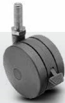
Ultima Page 30-31