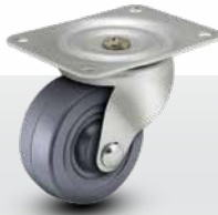
General Duty Page 13