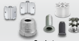
Sockets Page 56-57