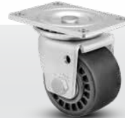
BLS/BMS Page 15