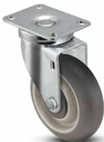
Institutional Page 10-12