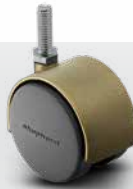
Pacer Page 32