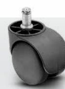
Chair Page 34