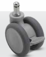
Genesis TW Page 35