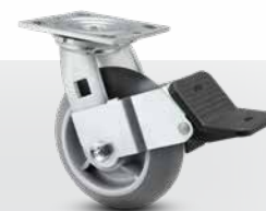
Pemco E-Line Page 42-43