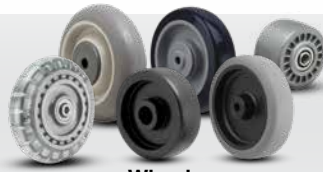
Wheels Page 48-55