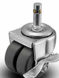
00 Series Page 14