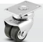
BDS/BDR Page 16