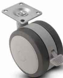
Softech Page 28-29