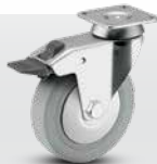
Razer Page 18