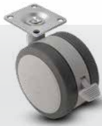
Softech Page 28-29