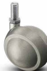
Ball Page 24-25