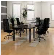
Design Innovation Page 27