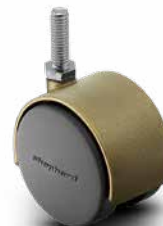
Pacer Page 32