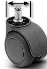
Pivot boss diameter