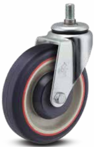
Standard Zinc plated