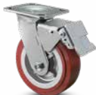
Total Lock Integrated into swivel fork.