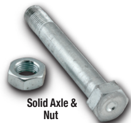
Solid Axle & Nut ZJ085409 Shown