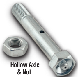
Hollow Axle & Nut ZJ085408 Shown