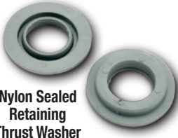
Nylon Sealed Retaining Thrust Washer