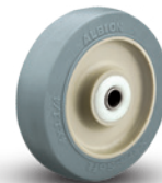
XS Prevenz™ X-tra-soft Rubber Flat Tread