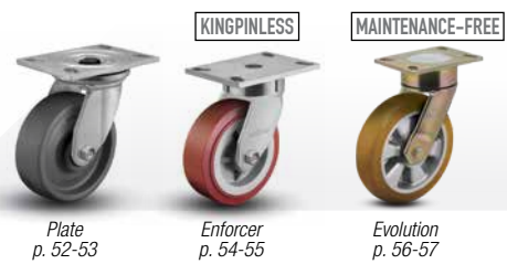
Plate p. 52-53 Enforcer p. 54-55 Evolution p. 56-57

Tread Width: 2" or 2-1/2" Wheel Diameters: 4", 5", 6", 8" and 10" Capacity: 300 lbs to 2,000 lbs each Brakes: Tread lock, side lock, swivel locks