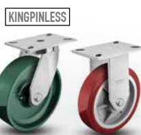
Enforcer p. 60-61

Tread Width: 2-1/2" or 3" Wheel Diameters: 6", 8", 10" and 12" Capacity: 540 lbs to 6,000 lbs each Brakes: Tread lock, swivel lock