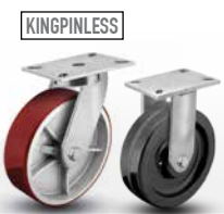
Enforcer p. 58-59

Tread Width: 2-1/2" or 3" Wheel Diameters: 6", 8", 10" and 12" Capacity: 500 lbs to 6,000 lbs each Brakes: Tread lock, swivel lock