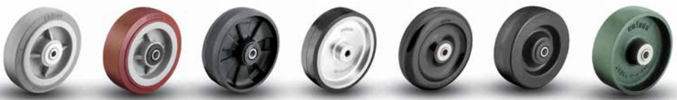
Rubber & Thermoplastic p. 68-77 Polyurethane p. 78-82 Nylon p. 83-85 High Temp p. 86-87 Polyolefin p. 88-89 Phenolic p. 90-91 Metal p. 92-95