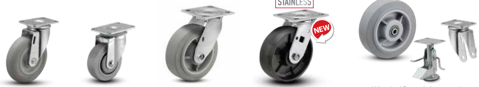
2 Series Plate p. 110 Dolly p. 111 4 Series p. 112-113 4 Series Stainless p. 114-115 Wheels / Parts & Accessories p. 116-122