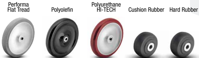
See the Performa Advantage on Page 67.