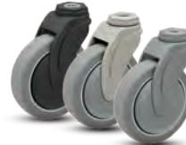
Custom Colors Available