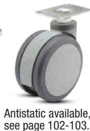
Antistatic available, see page 102-103.

Special colors available. Consult factory.