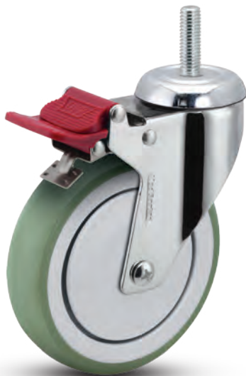
Anti-microbial TPR wheel with total lock CX-05AMP-125-TL-TS02