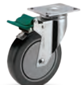
Direction Lock Green pedal.