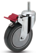
Total Lock Red pedal.