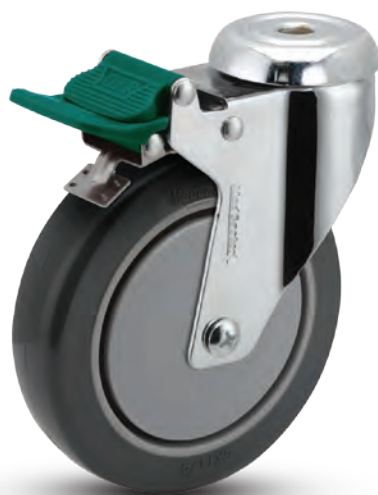
Polyurethane TPU wheel with direction lock CX-05PYP-125-DL-HK01