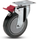
Total Lock Red pedal.