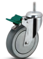
Direction Lock Green pedal.

Stems ship with a loose bolt for easier alignment of the directional lock.