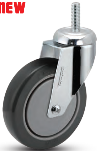
Polyurethane TPU wheel CX-05PYP-125-SW-TS02