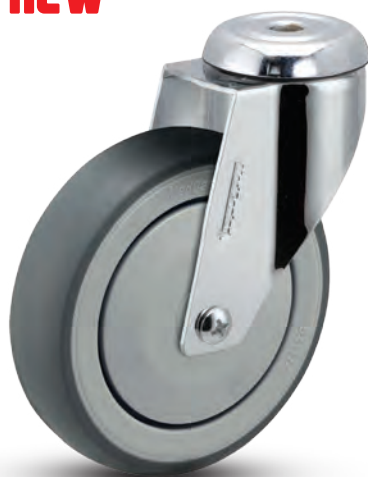
Thermoplastic rubber wheel CX-05TPP-125-SW-HK01