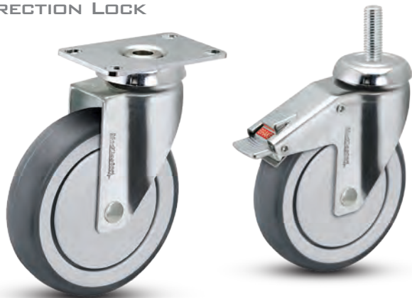
PLATE • HOLLOW RIVET • GRIP RING • THREADED • ROUND • SQUARE • SWIVEL TOTAL LOCK • DIRECTION LOCK