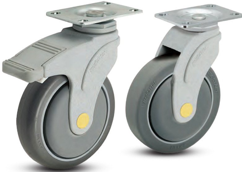
PLATE • HOLLOW RIVET • GRIP RING • THREADED FREE SWIVEL • TOTAL LOCK • DIRECTION LOCK