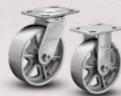
CA Cast Iron