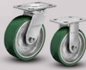
PD Polyurethane on Aluminum