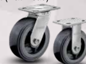
XA Polyurethane on Polypropylene