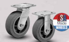
XS X-tra Soft (Flat Tread)