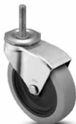
Monarch Page 9