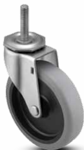
Regent Page 6-8