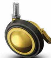
Ball Page 24-25