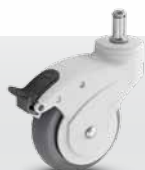
Optimus Page 20