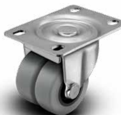
00 Series Page 14