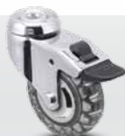
RS/RT Page 18