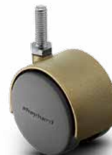
Pacer Page 32