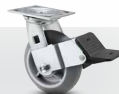
Pemco E-Line Page 42-43