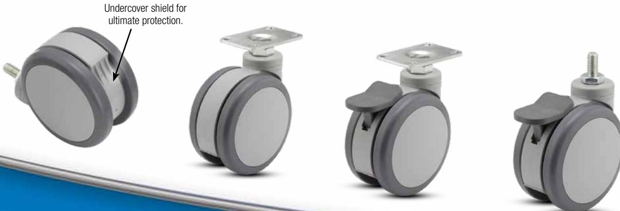
Undercover shield for ultimate protection.